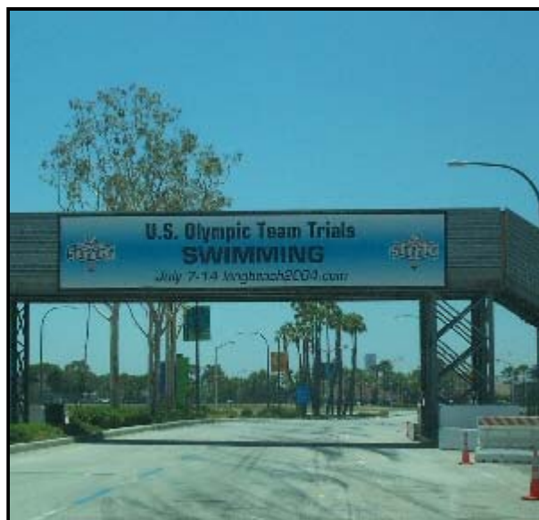
"The site is really incredible considering 1) it's normally a parking lot and 2) the Long Beach Grand Prix was sitting there less than a month ago. You can still see tire marks that were left on the roads from the race cars." Tim Takeshita, Nike Swim