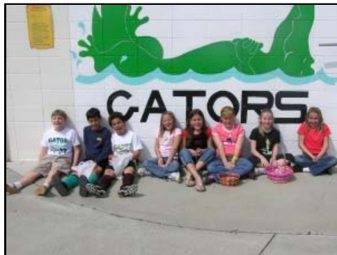
These veteran GATOR swimmers were on hand to welcome new swimmers to the team and are very excited and anxious for the season to start!