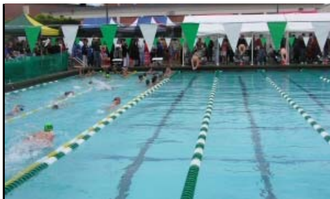
De La Salle pool