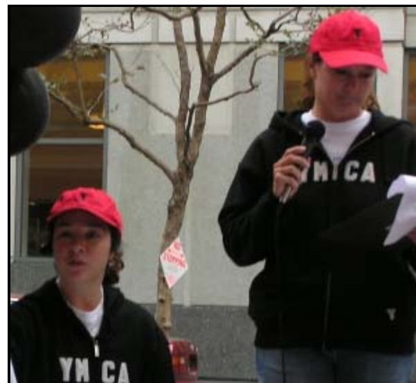
The announcers were full of smiles and kepts things going smoothly.