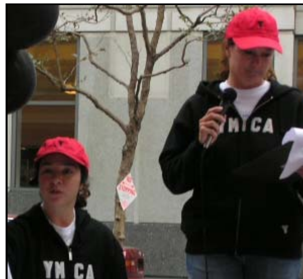
The announcers were full of smiles and kepts things going smoothly.