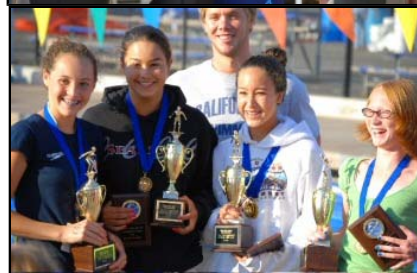
Crow Canyon Sea Lions 11-12 Girls are all smiles after a great record setting year. See their records below.